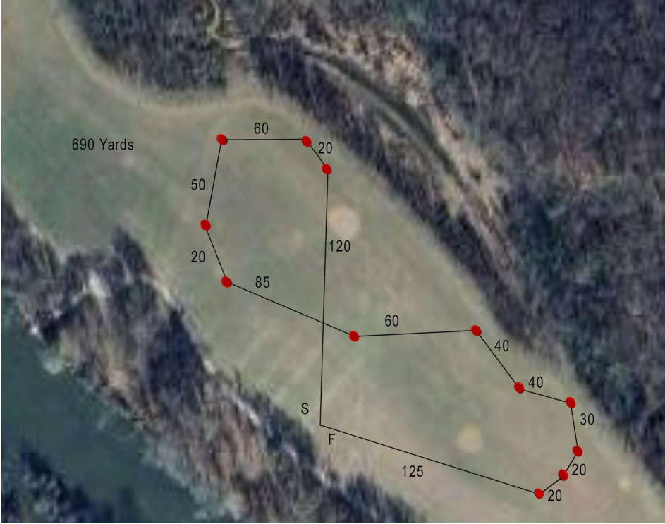
Saturday Course Plan